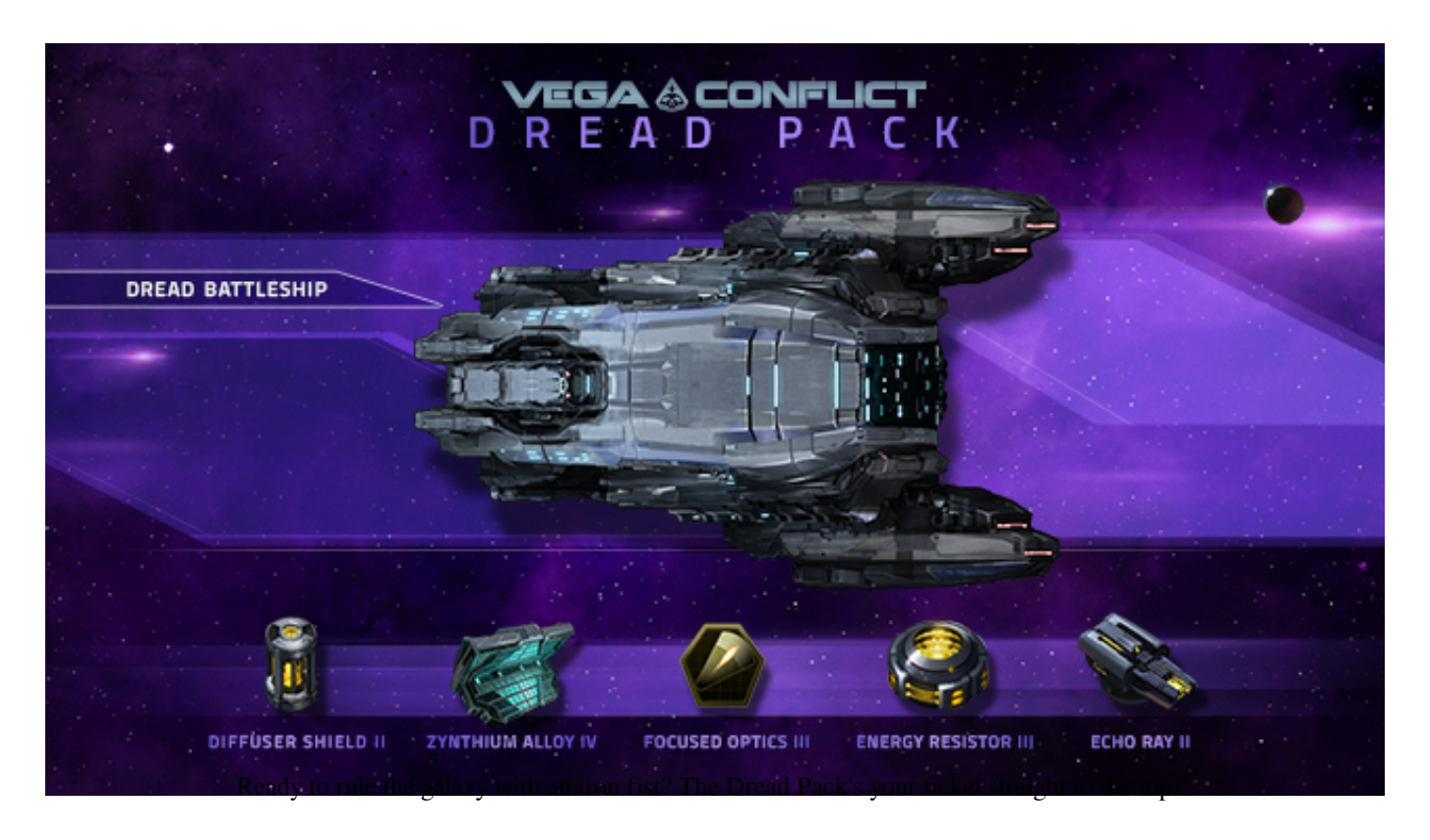
Dread Battleship (x4) - The massive, cutting edge Dread Battleship truly lives up to its name and is a true force to be reckoned with.

2000 Coins - Providing you with the ability to build upon your base assets with the latest tech and resources. Bonus Gold will really help you make your mark in the sector.