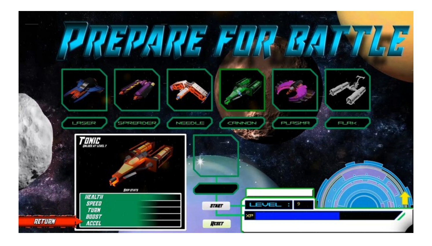
Hyperborea - EBook: Lore, Art, And Design Keygen Generator